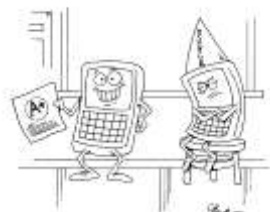
A Smartphone And His Not So Smart Brother.

An elementary school had two second grade teachers; Mrs. Payne and Mrs. Hacking. One day a parent called into the main office to let them know her daughter would not be in class that day. The administrator asked, "Is she in Payne or Hacking?" Confused, the parent replied, "Neither...we have company today and I'm keeping her home."