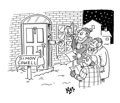
"You're out of key, and you've totally picked the wrong number for your vocal range. Face it, you'll never make it as carol singers!"